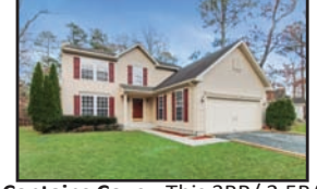
Captains Cove - This 3BR/ 2.5BA Colonial located on a cul de sac has been given a face lift! MLS# 48923 $189,900