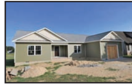
Captains Cove - BRAND NEW construction on the 4th fairway. Single story, 3BR/2BA MLS# 49909 $197,500

YOUR HOUSE HERE! From "list to close," we're selling homes faster. Who you work with makes a difference. Let LONG & FOSTER sell your home!