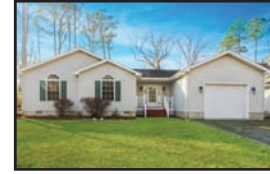
Captains Cove - This home is sold furnished! Enjoy all of the amenities offered! MLS# 48985 $168,900

Captains Cove Lots Corner Lot 1096 - $12,500 Lot 862 - $3,500 Cleared Lot 802 - $35,000 Lot 124 - $5,000 Lot 7 - $3,500 Lot 74 - $1,500 Some lots have sewer hookup avail. Call to inquire.