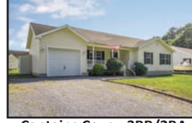
Captains Cove - 3BR/2BA Hardwood floors, open kit. w/ pantry! Great storage! MLS #49948 $164,500