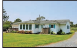
Chincoteague - Creek-front ranch is truly a gem! Located on just shy of 3/4 Ac. & has a boats-hed/studio on the creek, newer HVAC & septic, garage! Fireplace MLS# 49967 $295,000