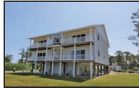
Chincoteague - Phenomenal S. Main St! island home w/ spacious rooms, MBR, fireplace & deeded access to the Chincoteague Bay?? MLS# 49969 $289,900