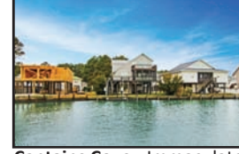
Captains Cove - Immaculate 4BR waterfront home w/ multiple decks. Sold turn key! MLS# 48795 $330,000