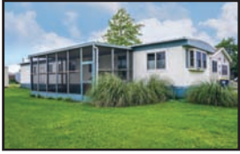
Chincoteague - Here is your chance to own an affordable island getaway! 3BR home has been well maintained. MLS# 50025 $87,500

(757.336.5100) Chincoteague & Captains Cove (757.824.5195)