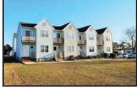
Chincoteague - BEST DEAL on the island! 2BR/2.5BA town home just steps to Maddox Blvd. Great Parking! MLS# 49776 $149,900

YOUR HOUSE HERE! From "list to close," we're selling homes faster. Who you work with makes a difference. Let LONG & FOSTER sell your home!