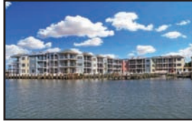
Sunset Bay #318 Beautiful 3BR condo on Chincoteague Bay. 3rd floor unit, Low/no maint., pool, fitness room, plenty of parking! MLS# 49878 $365,000