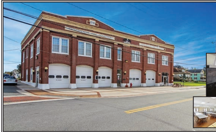
Historic Chincoteague Fire House Circa 1930

As Chincoteague celebrates our new fire station on Deep Hole Road, we're looking for a new owner for the old station. Ask any local or seasoned come here — they'll tell you about the rich history of the Main Street firehouse. Hot chocolate after the Christmas parade. Auctions & fund raisers. And who could forget bingo and pancake suppers!