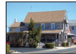
HOME w/RETAIL SPACE downtown Main St. Work & live at same location $249,900