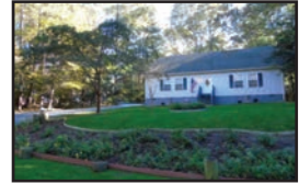
4BR/3BA COVE HOME $159,900 BEST BUY IN THE COVE!!