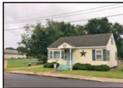
LOWEST PRICE! Cute cottage in town $126,000!!