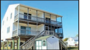
VIEWS OF ASSATEAGUE 2BR/2.5BA duplex, MBR Suite Ext. Storage! REDUCED $219,000