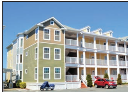
Beautiful Sunset Bay Villa 209 Open concept, offered turnkey with styl- ish furnishings elevators, marina, pool & fitness room! REDUCED $365,900