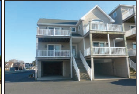
Big & Beautiful waterfront townhome on Chincoteague Bay! 2 parking garages, MBR suite, 4 waterside balconies & so much more! Dock & Pier $499,000

Experience the greatest alternative to hotels.