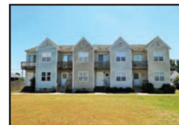
NEW LISTING 2BR/2.5BA Townhome $179,000