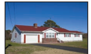
Parks Rd.—3BR on 3.5 acres Wood floors, fireplace, large wkshp on slab w/elec. $197,500