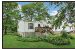
WONDERFUL 3BR/2BA island home, great kitchen, fireplace $177,000