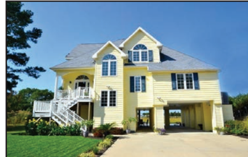
Right out of HOUSE BEAUTIFUL—this water- front residence has a fantastic location, and classic high-end features. New grinder pumps in! By appointment $428,500