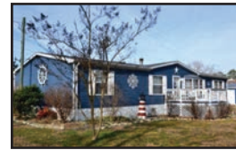
Barely Lived In & Well Maint. New siding, flooring, HVAC, & roof in last 2 yrs. $175,000