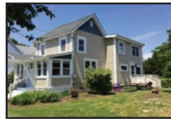
3BR/2BA Renovated Near town, LRG scr'd porch & workshop $238,000