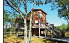
TRANQUIL ISLAND RETREAT Contemporary home on over 3 acres. $375,000