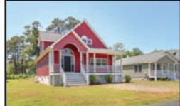
Barely Lived In 3BR Island home—Sold furnished $315,000