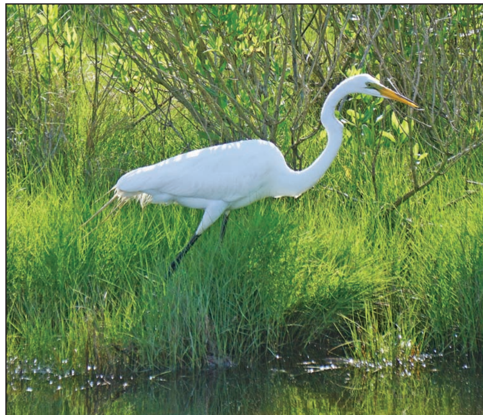
An egret, a likely encounter on an island tour or kayak eco-tour of Chincoteague or Assateague island.

Remember all those times Dad made you go for hikes or bike rides