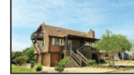
3BR WATERFRONT in Captains Cove $249,900