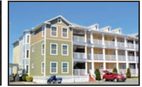
SUNSET BAY CONDO Pool, Marina, Elevators $365,900