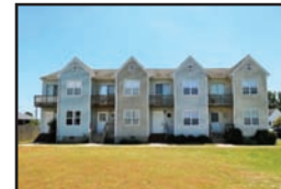
NEW LISTING 2BR/2.5BA Townhome $179,000