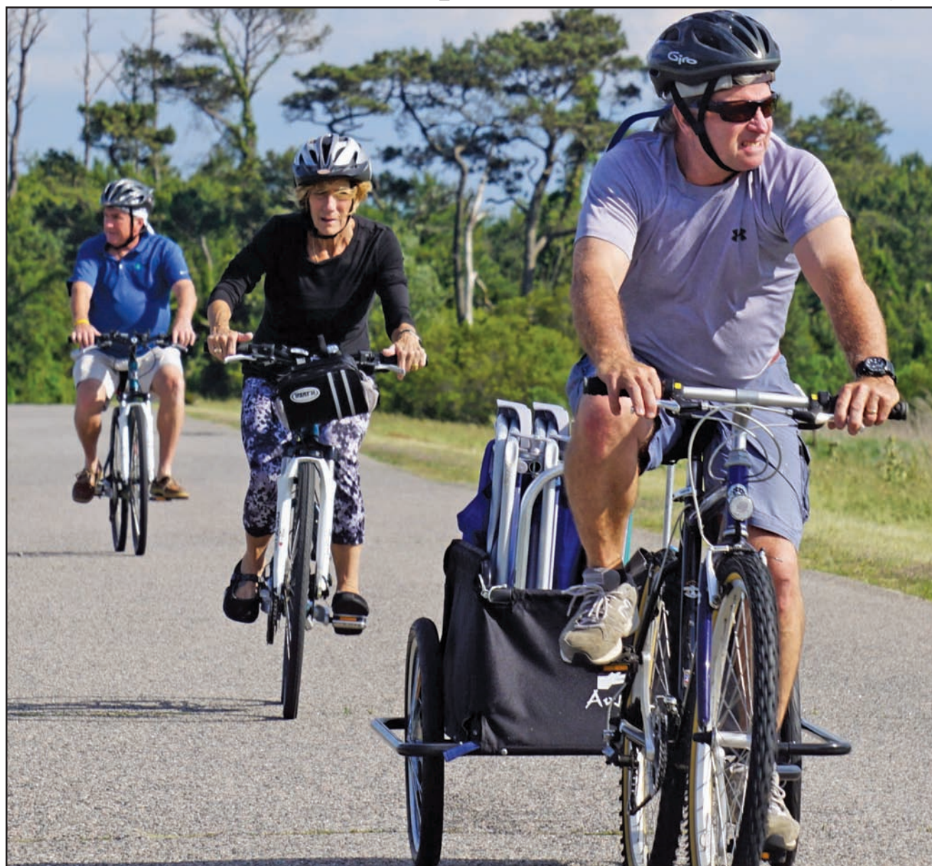
Cyclists on a trail at Chincoteague National Wildlife Refuge, number three on the top 10 list of suggested Father's Day activities on and around Chincoteague.

The family can ride in style this Father's Day and your dad can feel like the king of the road while driving a scooter, electric bike or a low-