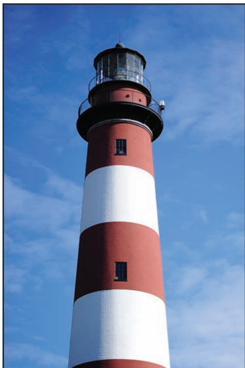
Assateague lighthouse

speed, street-legal vehicle. Call Fun on Wheels, 757-336-5348, to check for daily or hourly rates on renting a sweet ride and explore the island while feeling the wind through your hair. Other bike rental outlets can be found at http://www.chincoteaguechamber.com/category/96-bike-rentals