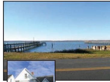
Traditional Two-Story WATERFRONT on S. Main Street $306,000