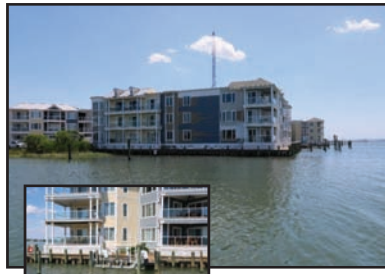
Beautiful Sunset Bay Villa #120 First floor condo with desirable courtyard location. Boat slip and davit included. Tastefully furnished & furnishings convey! $399,900