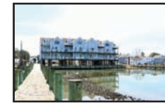
Beautiful WF Townhome w/shared pier $460,000