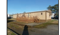
PERFECT BEACH GETAWAY 3BR/2BA * $79,900