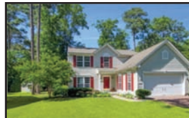
Captains Cove Home 3BR/2.5BA $205,000