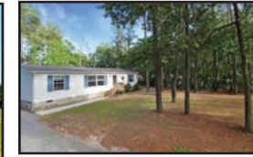
Well Maintained 3BR/2BA New Church, close to NASA $129,999