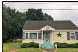
Island Cottage Light & bright, upd. bath, walk to town! $126,000