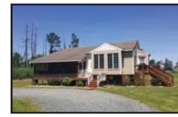
OYSTER BAY II New dishwasher, fresh paint, furnished. $247,500