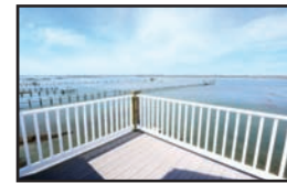
WHAT A VIEW! Luxury S. Main St. Bay Front TH w/long PIER!! $460,000