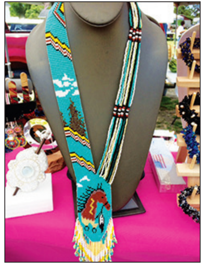
Last year's Artful Flea saw a wide range of merchandise, including local seafood, stone and beaded jewelry, and hand-made ukuleles.