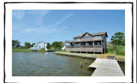
MOONDANCE ~ beautiful 4BR waterfront rental w/floating dock! June weeks still available! Sleeps 8. Call or Book On-Line!