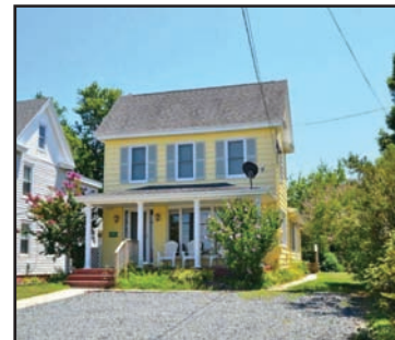
Reno'd Traditional Main St. Home Downtown location, 1st floor BR & BA Wood floors, Dining Rm., Sold Furnished! REDUCED!! $310,000