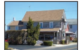
Downtown Main St. Dual Use Retail & Residential $249,000