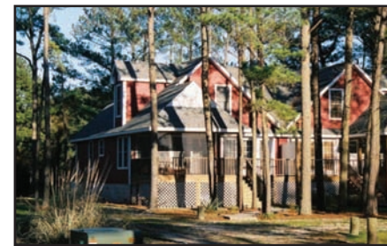
LOW MAINTENANCE DUPLEX HOME Open Concept, Fireplace, Lrg. Screened Porch MBR Suite, Upgraded Systems, Plenty of Parking, VR home sold furnished! Come See!! REDUCED!! $229,500