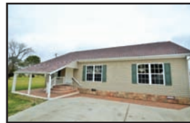
3BR Cove Home Walk-in Closet, NEW HVAC $120,000