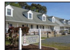
Modern Townhome Completely Renovated REDUCED $189,900