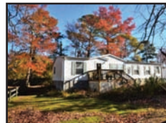
Well Maintained Island Home 3BR, Lrg. Scr.Porch $177,000