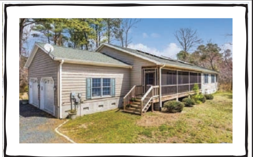
NEW RENTAL ~ Tranquil Escape is a very large 4BR ranch, screened porches, huge open concept KIT./DR. Sleeps 10! Good weeks still available. Book On-Line!

Property Management Services for Vacation Rental Homes, Long Term & Short Term Rentals