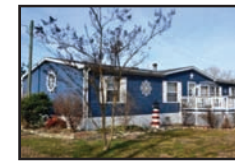
LOTS OF ROOM 3BR, Garage, Great Closets $175,000