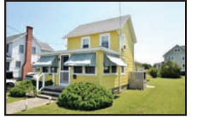
Main St. Waterfront w/LONG PIER $258,240