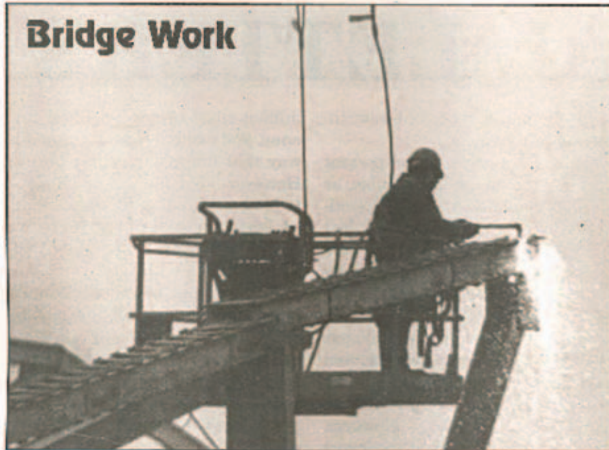
A workman atop the old Chincoteague bridge uses his torch to cut away a section as the removal of the bridge begins. Although the dismantling of the bridge, which has provided passage to Chincoteague and Assateague islands since 1940, began in earnest Monday morning, workers began positioning equipment and acetylene tanks Sunday evening, working most of the night. The work went on Monday despite a sharp wind and rainy conditions. A new bridge and spur to Marsh Island cost $69 million and opened recently.