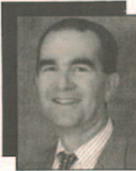
By Sen. Ralph Northam

G reetings from Richmond! The General Assembly Session