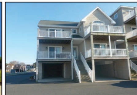
Big & Beautiful waterfront townhome on Chincoteague Bay! 2 parking garages, MBR suite, 4 waterside balconies & so much more! Dock & Pier $499,000

Experience the greatest alternative to hotels.