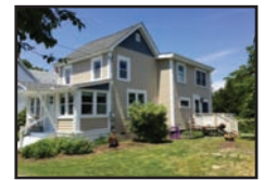
RENO'd CLASSIC 2-STORY waterfront floors, baths on 2 flrs. huge scr.porch/workshop $238,000