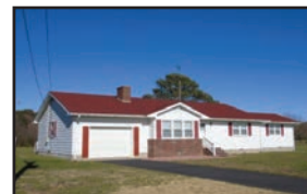
Parks Rd.—3BR on 3.5 acres Wood floors, fireplace, large wkshp on slab w/elec. $197,500