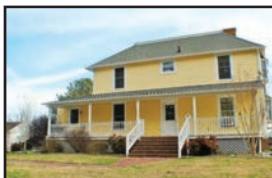
BIG & BEAUTIFUL 4BRs — 1.5 acre & waterviews of Metompkin Bay & pond $310,000