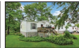
WONDERFUL 3BR/2BA island home, great kitchen, fireplace $177,000