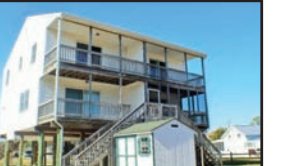
VIEWS OF ASSATEAGUE 2BR/2.5BA duplex, MBR Suite Ext. Storage! REDUCED $219,000