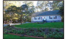
4BR/3BA COVE HOME $159,900 BEST BUY IN THE COVE!!