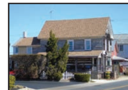
HOME w/RETAIL SPACE downtown Main St. Work & live at same location $249,900