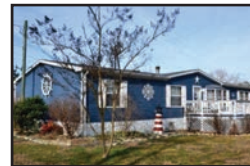
Barely Lived In & Well Maint. New siding, flooring, HVAC, & roof in last 2 yrs. $175,000