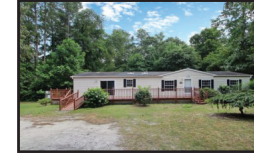
Country Escape 3BR & Bonus Room on one acre! $145,000