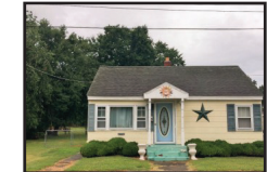
2BR Island Cottage Located close to town $126,000