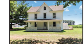
4BR Renovated Farmhouse New floors, new appliances! You dream home! $169,000