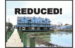
REDUCED! Beautiful WF Townhome w/shared pier. MBR Suite! Amazing Sunsets! $450,000