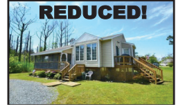
REDUCED! Oyster Bay II Ranch Home New dishwasher & fresh paint! $239,500