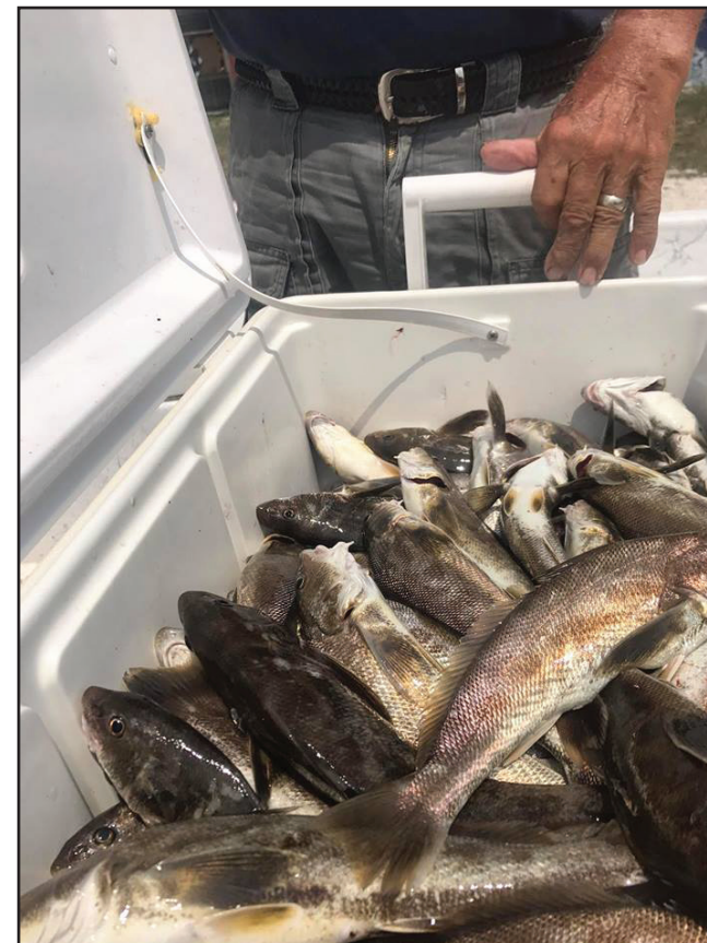
Kingfish (whiting) have been caught by the cooler-full.