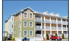
SUNSET BAY CONDOS We have several units for sale starting at $365,900!