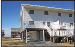
2BR/DEN Water Views Deeded water access! 5- star features! $319,000