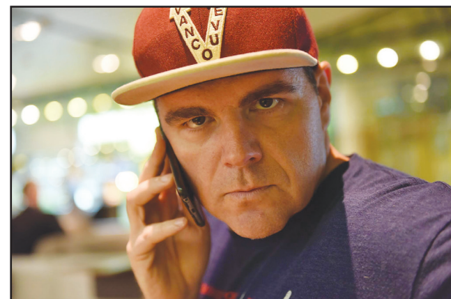
Submitted Image Comedian Ian Bagg will appear at the Palace Theatre Aug. 4. Online tickets can be purchased at http://bit.ly/IanBaggTickets

The NHS class reunion is the night of Saturday, Aug. 5, above the Cape Charles Coffee House.