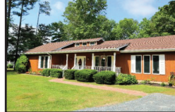
3BR/2BA Renovated Newer HVAC, new flooring, new MBA!! $220,000