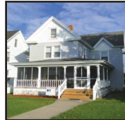
S. Main St. Victorian Open Kitchen/dining, lots of storage, attic! $306,000