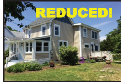
REDUCED! 3BR/2BA Renovated Near town, LRG scr'd porch & workshop $226,500