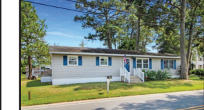
3BR/2BA Ranch Scr.Porch, Deck & More $178,000