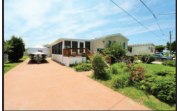
3BR/2BA Mobile Home Large detach. Garage & screened porch!! $136,800