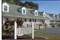
Renovated 2BR/2.5BA All new everything! Granite kitchen. REDUCED $189,900