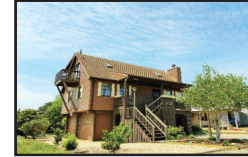
3BR WATERFRONT in Cap- tains Cove. Pool, golf and Marina Club $249,900