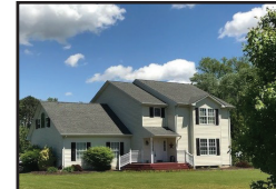
Beautiful Country Colonial Great acreage, lrg. Workshop! Chinco. Sch. District. $239,900