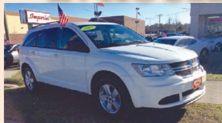
2013 Dodge Journey SE Call For Price