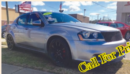
2013 Dodge Avenger SXT

Come to Imperial Motors where we specialize in financing for all. Over $2 Million in inventory, all with warranties up to 3 years!!!! 10 minute approval with rates as low as 2%. If you are in the market for a luxury vehicle at an affordable price, then come check us out.