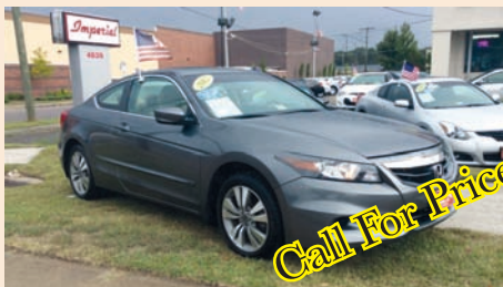
2012 Honda Accord EX-L