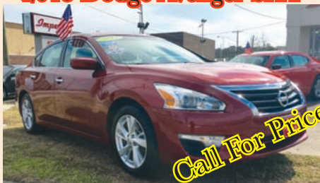
2010 Nissan Altima 2.5 SV