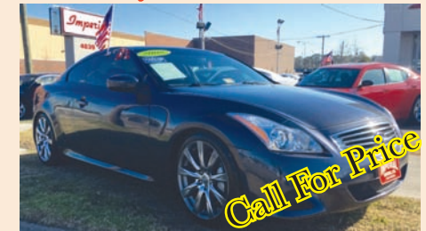
2008 Infiniti G37