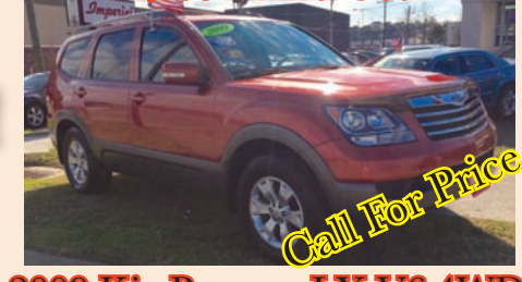
2009 Kia Borrego LX V6 4WD