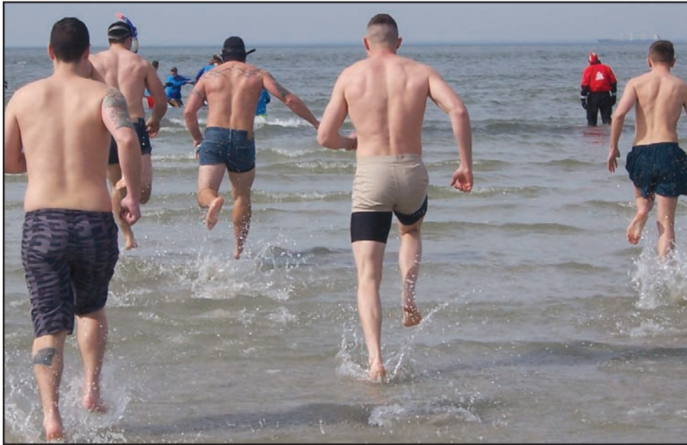
In with the boys ...