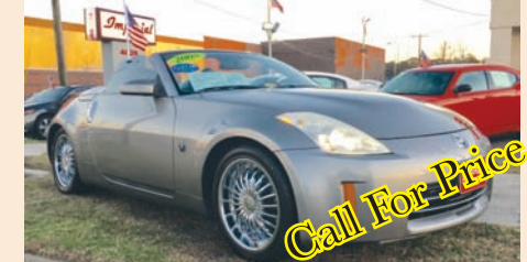
2008 Nissan 350Z