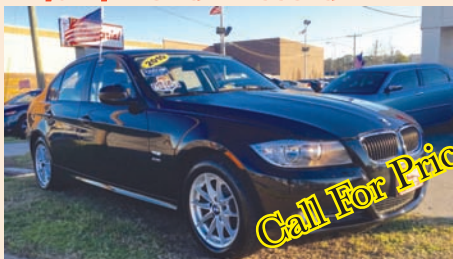
2010 BMW 3-Series 328i Xdrive