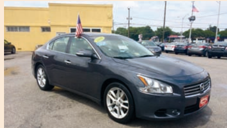
2010 Nissan Maxima SV Call For Price