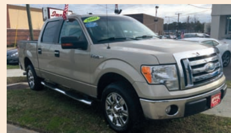
2009 Ford F-150 XLT Call For Price