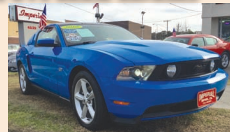
2010 Ford Mustang GT Call For Price