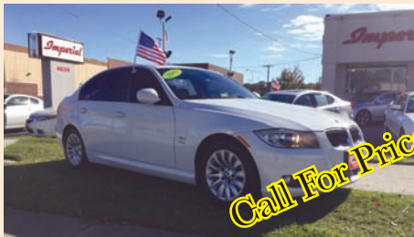
2009 BMW 3-Series 328 X1