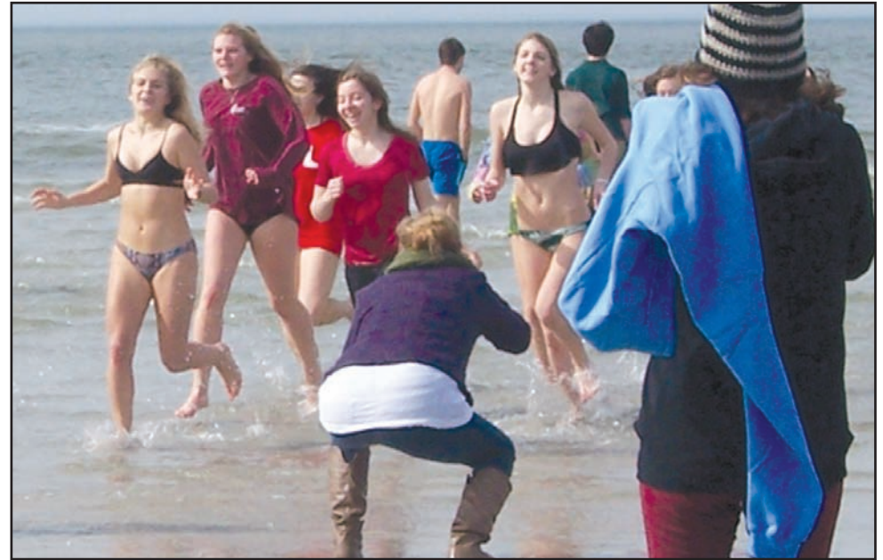
... out with the girls