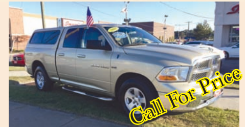
2011 Ram 1500 SLT Quad Cab