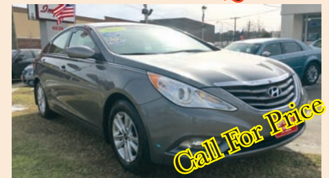
2013 Hyundai Sonata GLS